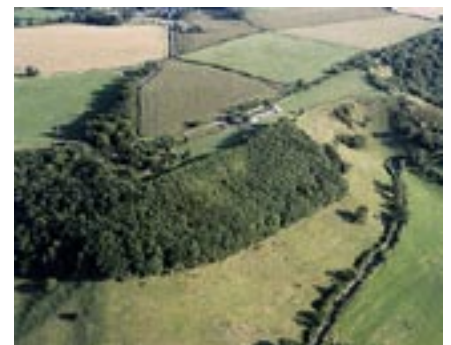
6. Walkers on the Cotswold Way at Frocester Hill enjoy stunning views across the river Severn to Wales.