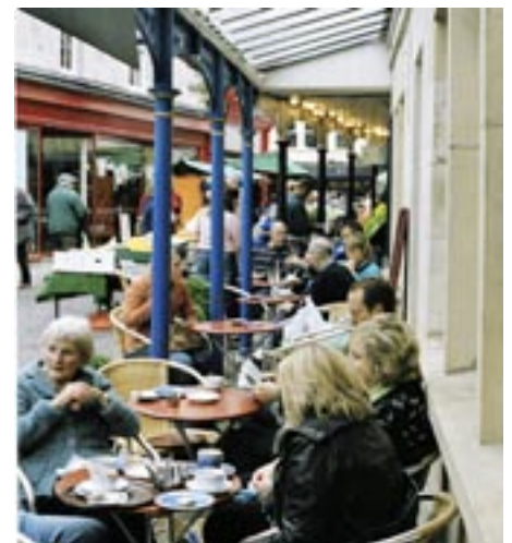
5. Cafe lifestyle in Stroud on market day