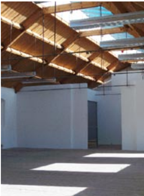
1. Newly refurbished painting studios at Stroud Valleys Artspace